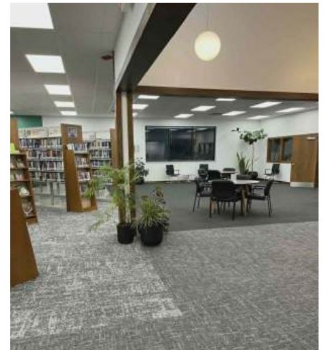
Check out our new lobby.

Though the library has gone through some significant changes, our dedication to our patrons and the community remain the same. Welcome to your library!