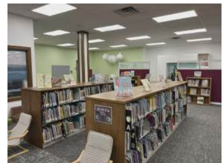
The children's section has a whole new look.