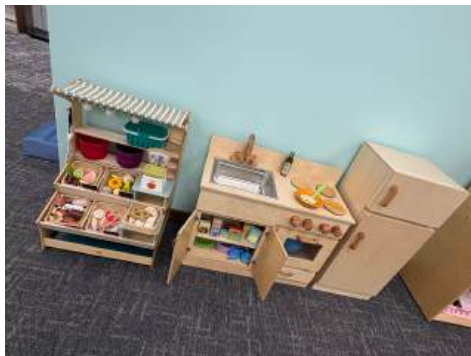
New wooden playsets for the kids!