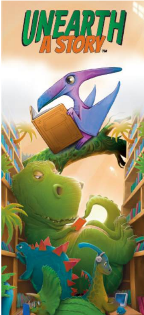
2026 Summer theme: Unearth a Story

The Adair County Public Library will be partnering with Blooming Speech Therapy, Parents as Teachers, and Truman State University to provide language and speech screenings for ages 2-5. This event will take place June 26 at 9-11am. These screenings are completely free and take place at the library.