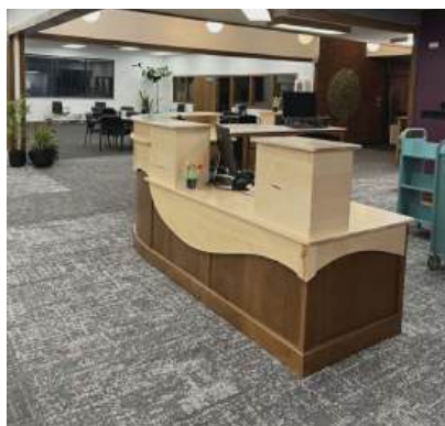
Look at our new wheelchair accessible front desk.