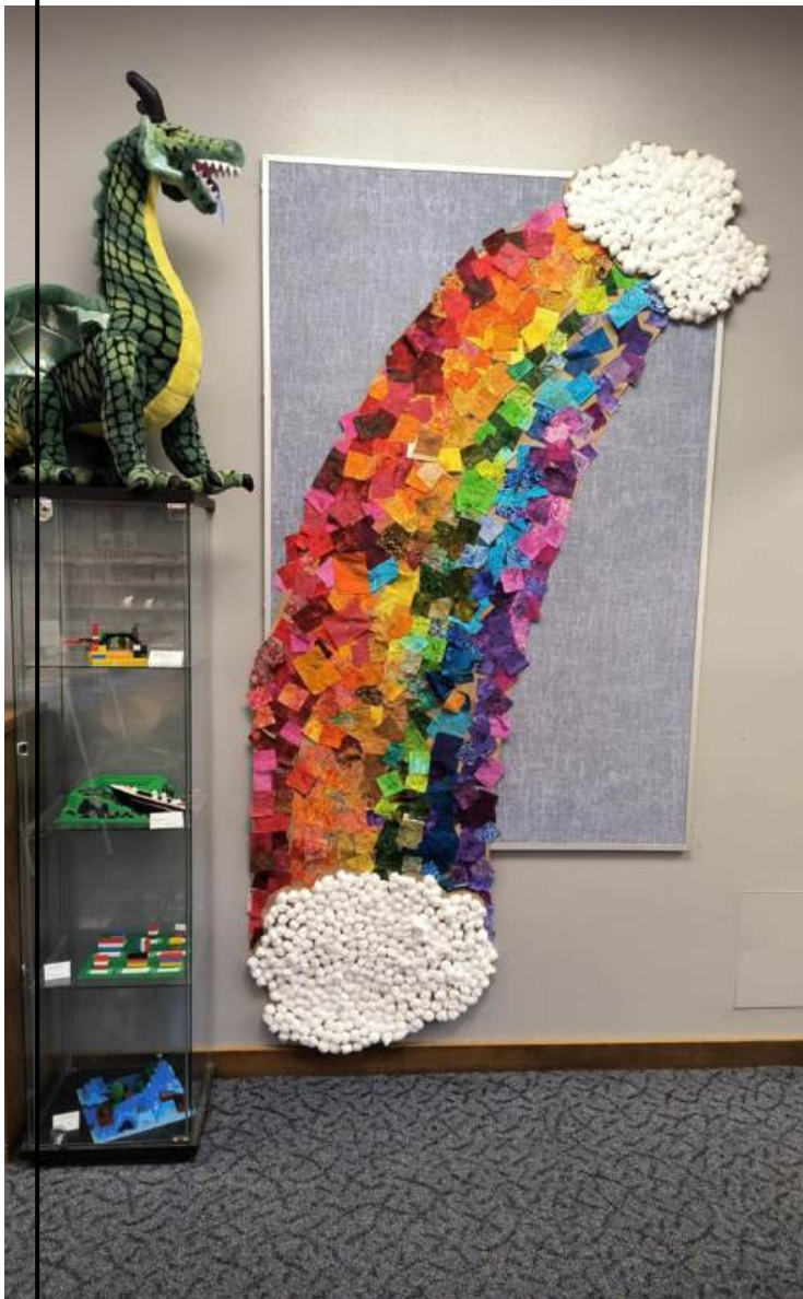
Our Previous Kid Collaborative Art Piece

Take Your Child to the Library Day will be February 7 th at 10AM-12PM. We will have games and fun all day, and at 10AM we will be doing a collaborative art project, which will be displayed on the library's bulletin board in the Children's Section.