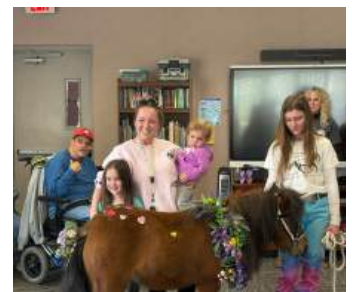
Cookie the Unicorn Always a Hit