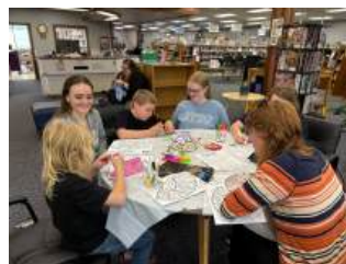
ATSU Encourages Brain Games