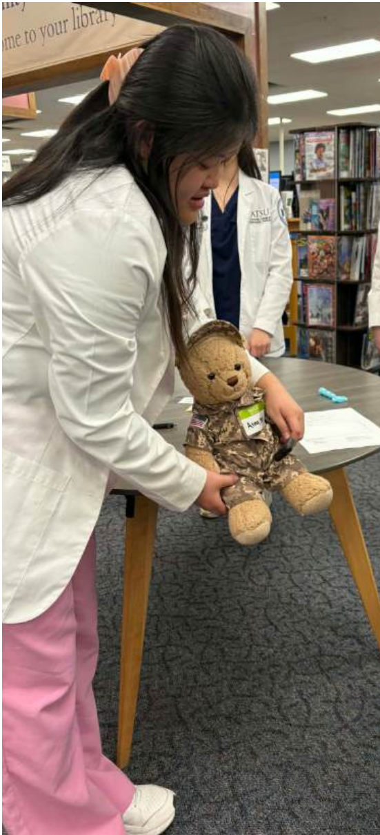
ATSU's Teddy Bear Clinic Was a Hit

The Adair County Public Library will be participating in the Kirksville Diversity Festival hosted by ATSU, Truman State University, and the City of Kirksville. We will be there from 1-4PM on April 25. Come see our amazing books and learn about all that we have to offer.