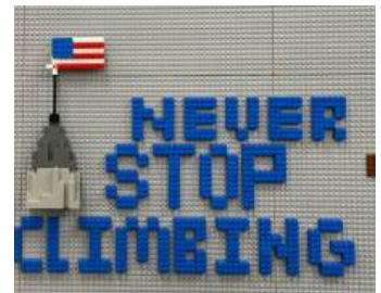
Check Out This Lego Creation