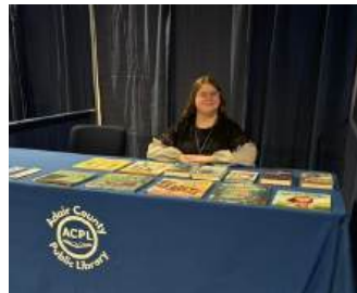
Community Engagement Conference