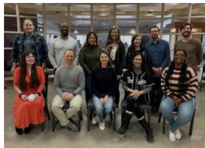
Children's Literature Festival

Continuing our movie night tradition, we will be premiering Zootopia 2 for our April movie. Movie night will be April 17th at 6PM. Zootopia 2 is rated PG and continues the story of Judy Hopps and her partner Nick Wilde with a brand new story with all new dangers and friends.