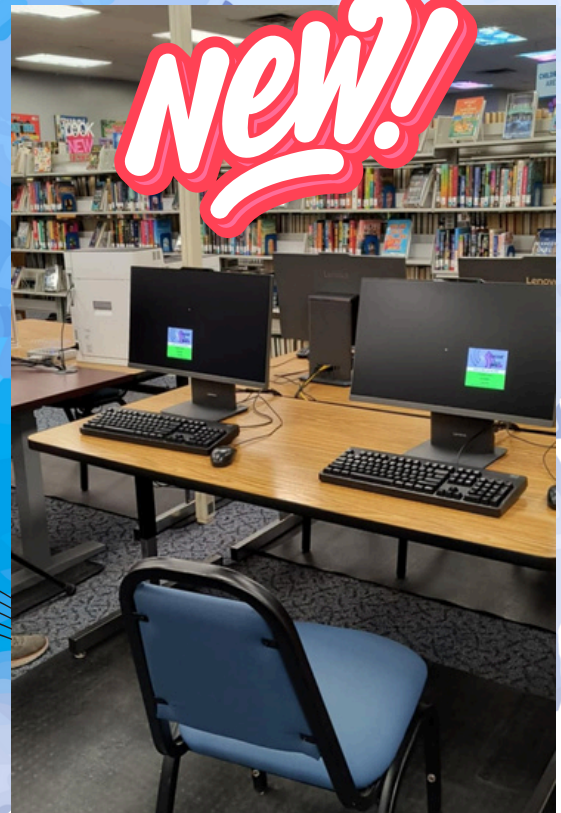
Check out our new patron computers!