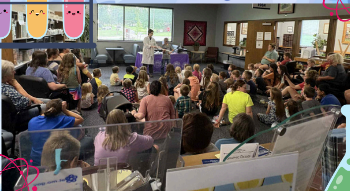
Mad Science brought in the crowd!