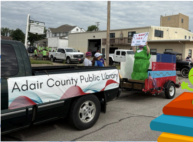
The Library participated in our first parade in years!