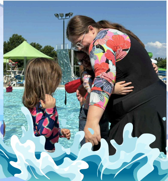
The Aquatic Center was so much fun for everyone!